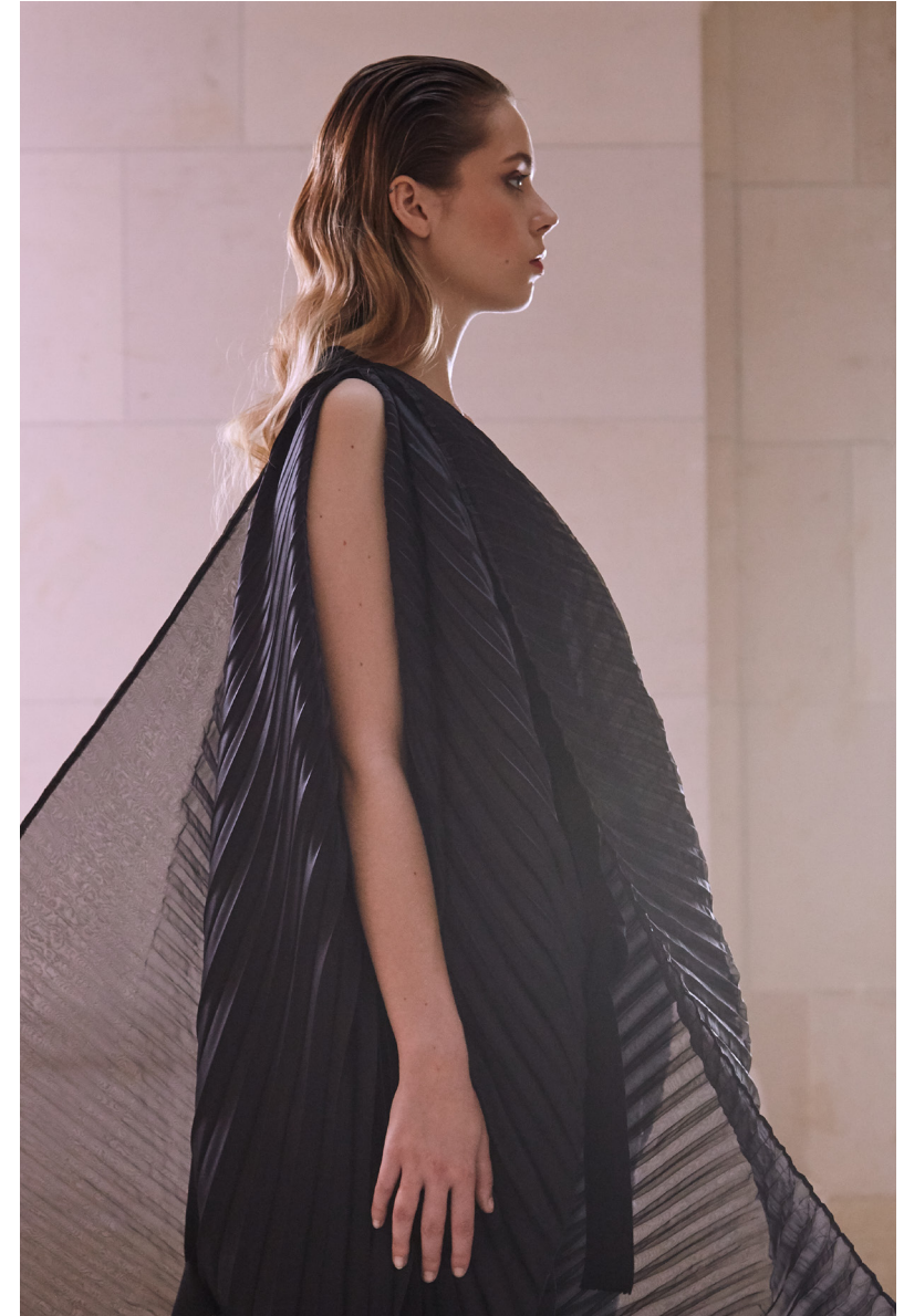
THE ARTS OF FASHION SUMMER MASTERCLASS 2018 FANGLIAN YUAN - CANADA | LASALLE COLLEGE INTERNATIONAL - MONTREAL | GUEST FASHION DESIGNER GUSTAVO LINS | VIP MODELS PARIS